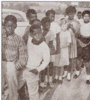
PUBLIC-SCHOOL OPENING IN PRINCE EDWARD FROM Southern School News II, NO. 4 (OCT. 1964):12