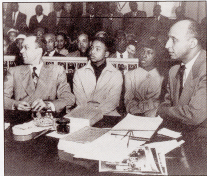
SPOTTSWOOD ROBINSON AND OLIVER HILL WITH TWO CLIENTS.

For the plaintiffs, the decision to step forward and file suit against the white establishment was difficult and dangerous, requiring courage and determination. The parents faced great personal danger for their involvement in the lawsuits. They lived every day with the dreadful bleakness, indignity, and barriers of segregation and Jim Crow laws. They saw the vast differences between schools for white children and Black children. They realized that school funding was grossly unequal and that their children received little or no benefit from the taxes that they paid to support the public school system. They knew that the curriculum in public schools for African-American children was inferior to that of white children, that school facilities were overcrowded and dilapidated, and that transportation was poor and in some areas of the State, nonexistent. They hated to see their children suffer such grievous inequities on the basis of their race. Some parents lost their jobs and many faced intimidation, threats, and violence against their families and themselves. Still, they set aside their own personal fears and moved forward with the lawsuits to make the future better for their children and grandchildren.