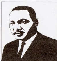
DR. MARTIN LUTHER KING, JR. MEMORIAL COMMISSION