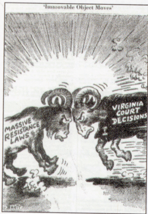
CARTOON FROM Southern School News 5, NO. 8 (FEB. 1959):1

The “Doctrine of Interposition” was introduced into the legislative lexicon. The Doctrine of Interposition holds that the federal government cannot impose its will