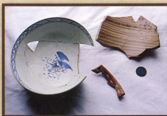
Artifacts recovered near the Sully slave quarter site.

Virginia slave owners, such as cornmeal, pork, herring and, occasionally, beef. Excavated coins may indicate that the slave quarter inhabitants participated in a cash economy selling homegrown foods or handmade objects to neighboring farms and communities.