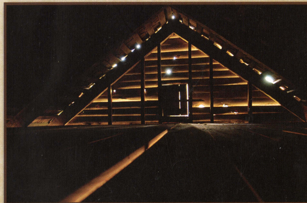
Slave quarter loft

The slave quarter was built to help illustrate the complex story of daily life and slavery in the late 18th century at Sully. Funding for the construction of the dwelling was provided by the Sully Foundation, Ltd.